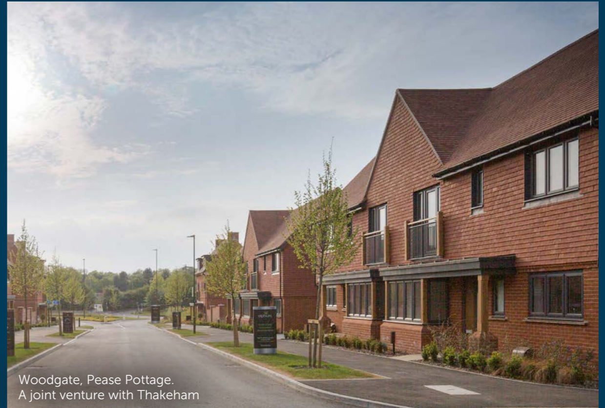
Woodgate, Pease Pottage. A joint venture with Thakeham