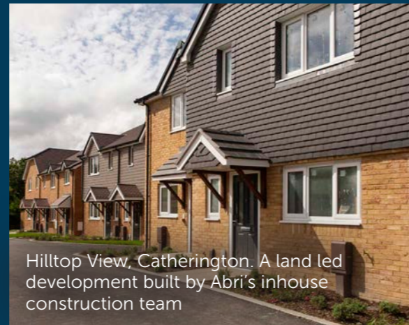
Hilltop View, Catherington. A land led development built by Abri's inhouse construction team

We can provide the right development solution whether that's land led, regeneration, joint ventures, package deals or Section 106.