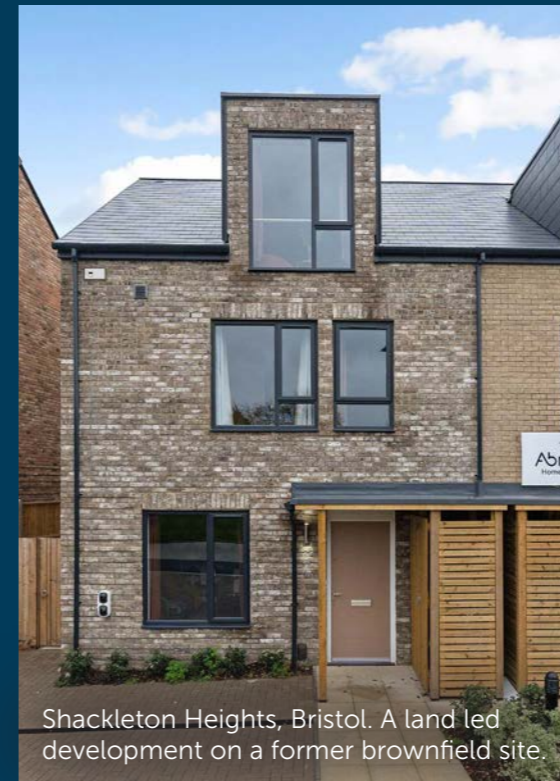
Shackleton Heights, Bristol. A land led development on a former brownfield site