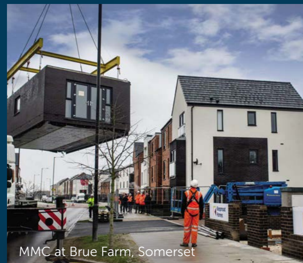
MMC at Brue Farm, Somerset