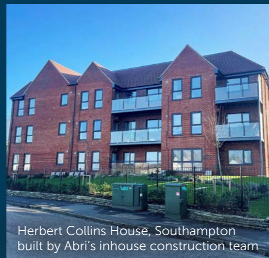
Herbert Collins House, Southampton built by Abri's inhouse construction team